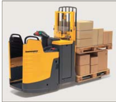
Fixed operator platform for maximum driver safety