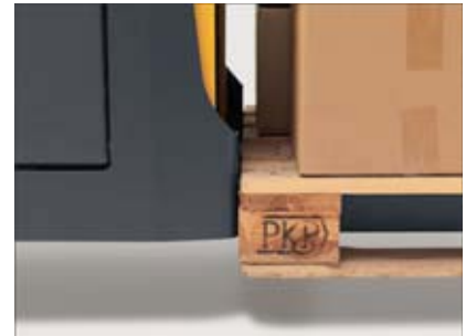
Precise operation with the pallet stop