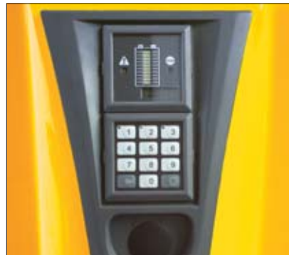
Access authorisation CanCode and CanDis (optional)