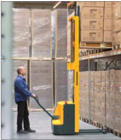
The EJC cuts a fine figure even in narrow racking aisles