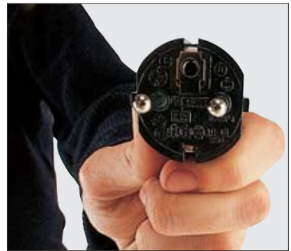
Integrated charger 30 A for comfortable battery charging at any mains socket