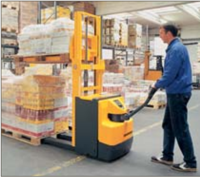
Superior in every travel situation