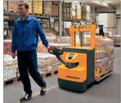
Stable also during cornering

The sprung, hydraulically cushioned support wheels are hydraulically linked. This system actively distributes the stabilising