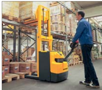
Comfortable during stacking and retrieval

All lifting and lowering functions are effortlessly controlled from the tiller head. This eliminates an awkward reaching round to levers on the truck chassis – compared with traditional trucks. Jungheinrich proportional hydraulics ensure here the sensitive control of the lowering speed – a great advantage, for example, for precise and soft depositing of loads on racking shelves.