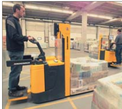
Retrieval with the ERC

All lifting and lowering functions are comfortably controlled from the tiller head without the need to turn round. Here the Jungheinrich Proportional Hydraulics facilitate sensitive control of lifting and lowering speed – essential for precise and gentle depositing of loads in the racking or exact positioning of the load for stacking in. In confined spaces, stand-on platform and side guards are simply folded in and the ERC is used in pedestrian mode. The low height of the platform ensures easy mounting/dismounting.