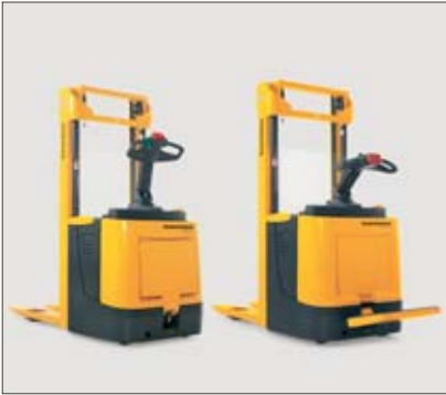
ERC 212 with stand-on platform folded up/down