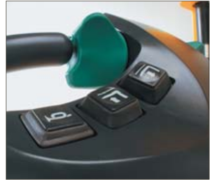
Buttons for sensitive lifting and lowering as well as horn

Jungheinrich-ProTrac optimises traction on the drive wheel. A spring cushioned system in the support wheel prevents the drive wheel from skidding on uneven floors. ProTrac provides stability on all four wheels during stacking and retrieval through hydraulic locking of the support wheel from 1800 mm lift height.