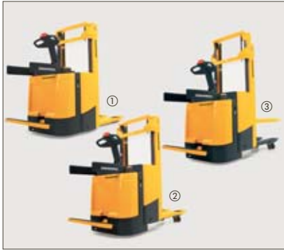
ERC Z14 with lowered forks ①, with raised support arm lift ② and with raised mast lift ③