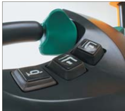
Buttons for sensitive lifting and lowering as well as horn

All lifting and lowering functions are comfortably controlled from the tiller head without the need to turn round. Here the