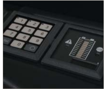
Access entitlement through CanCode and CanDis

Jungheinrich Proportional Hydraulics facilitate sensitive control of lifting and lowering speed – essential for precise and gentle depositing of loads in the racking or exact positioning of the load for stacking in.